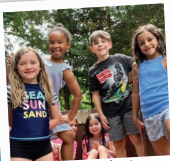
Creating Lifelong Friendships